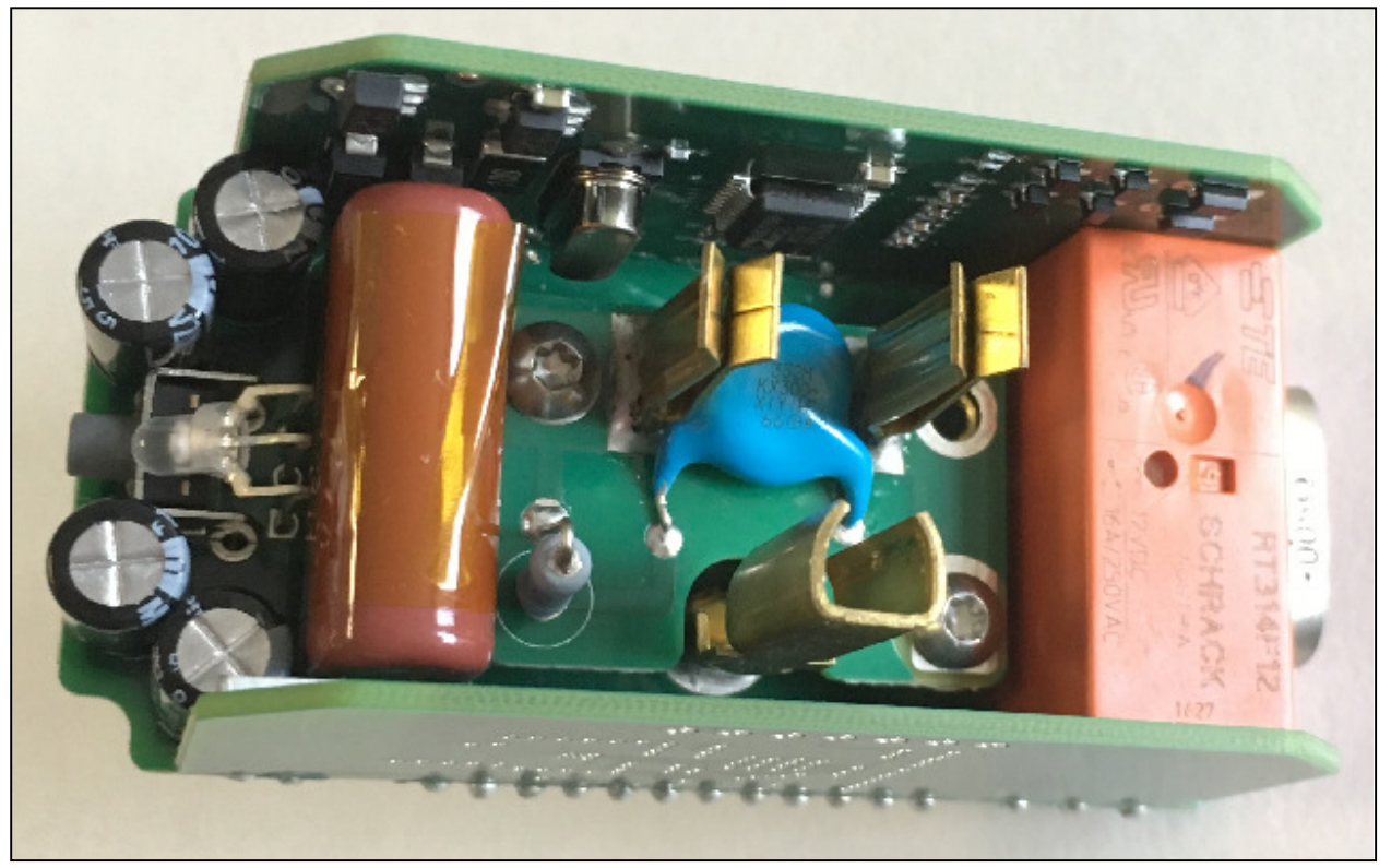
Drawing 1: Photo of example smart socket internal structure